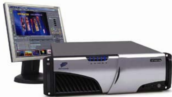
D 3 -CG Live 3D/HD Turnkey